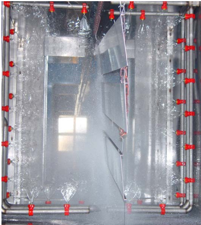
Low-pressure flowcoat, 3 - 5 PSI

PlafORIZATION Plus™, the Toran™-treated and topcoated metals pass the difficult water-immersion and hot water tests. This makes Toran™ 3 particularly well suited for higher-end performance requirement applications, more on the line of zinc phosphating.