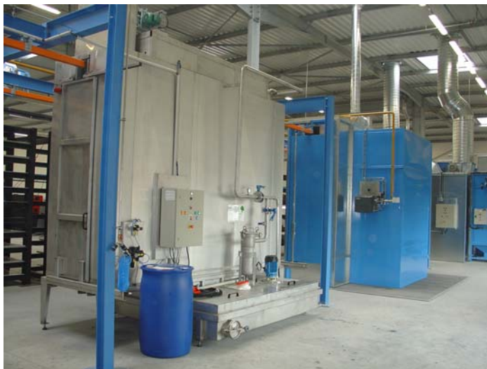
Batch flowcoat unit is compact.