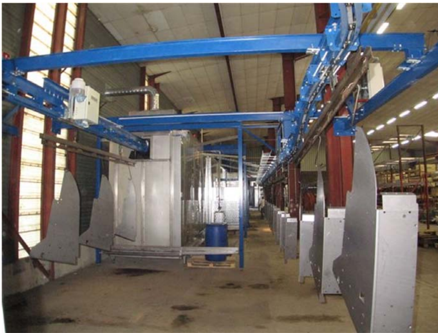
Toran™ system - converted from Plaforization™